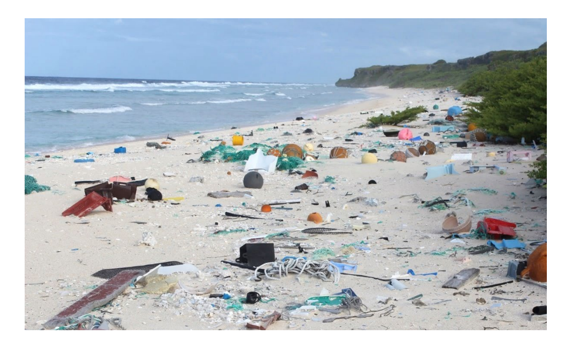
Figure 2: The Eastern coastline of uninhabited 'Henderson Island' ('Pitcairn Group', 24°22'30"S 128°19'30"W).

However, microplastics have been found in 25% of commonly consumed fish in Te Moananui (Forrest and Hindell, 2018), potentially transmitting associated toxins to consumers (Rochman et al. , 2015).