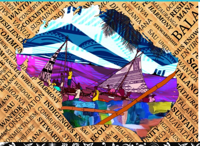
Figure 1: Vaka Moana (The Seafaring Canoe)

Terms like vanua, fenua, hanua, fanua, and whenua used across the region denote strong cultural and spiritual bonds between people and place. In Indigenous Fijian belief, vanua involves three connections: territorial (qele) land, social kinship (veiwekani), and cosmological dimensions (yavutu and vū). These holistic worldviews serve to address plastic pollution in its fullest relational, ethical, and most complex way. It is this systems approach to plastic pollution that is vital, and yet currently lacking in GPT negotiations. A translated summary of an Indigenous Palauan chant exemplifies their role as protective of the natural world: 'We are transiting this earth. We are, in a way, trespassers and we really don't own what is here. We don't own the land, the trees, the forest, the water. It is only the rocks and the water and the core of the earth that own the land. Therefore, it is our responsibility to ensure its continuity into the future". This chant describes a very different relationship to the human-centred and extractive relationship of non-Indigenous industrial societies.