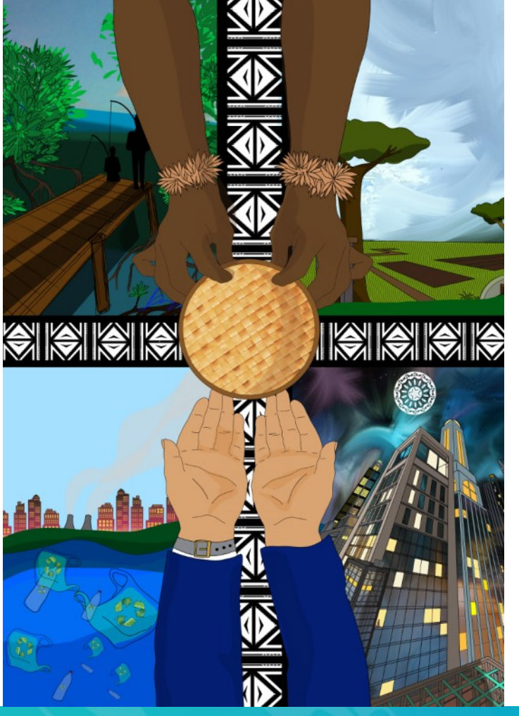
Figure 2: Veivosaki (The Discussion)

The Pacific employs regional conventions and frameworks to honour Indigenous rights. These regional mechanisms should be drawn on to support Pacific Indigenous full and meaningful participation in the INCs, intersessional, and treaty Conference of Parties (COPs).